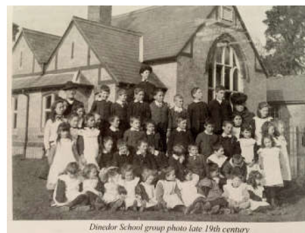
Dinedor School group photo late 19th century.